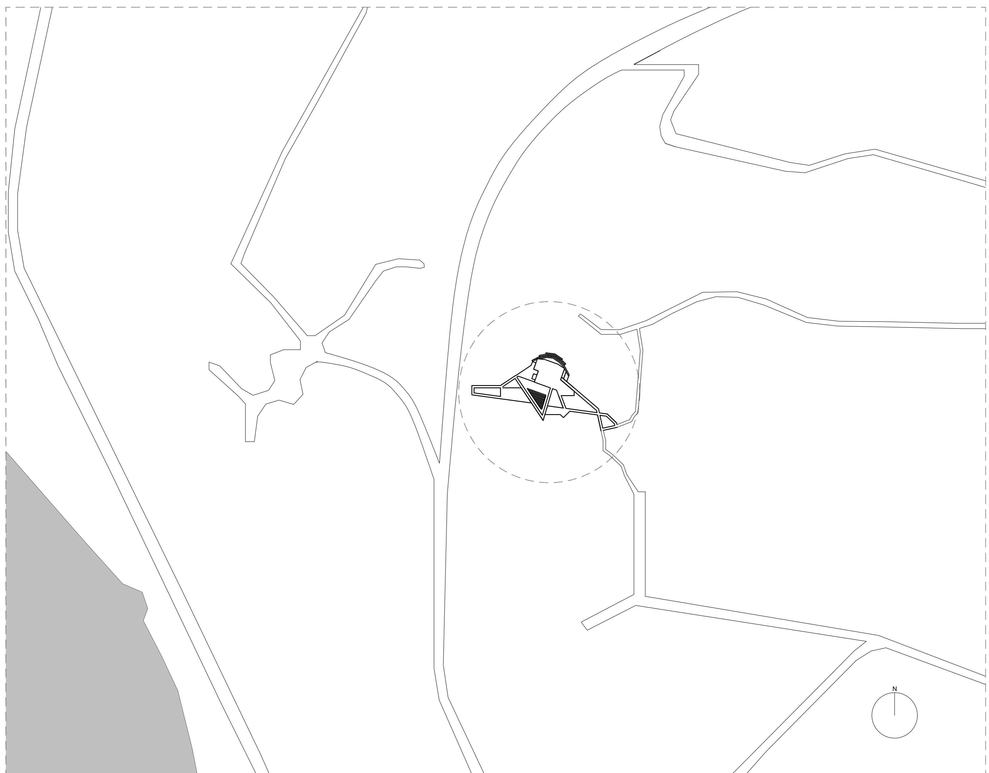
PLANO DE UBICACIÓN ESCALA 1:2000